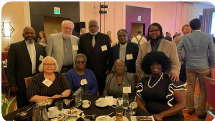
Members of the Diocese

April 20, 2023 at Marriott Downtown Charleston